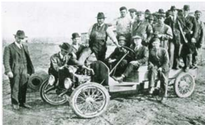
Texmobile truck is tested for weight with a 3,508 pound load.

Thank you to Charles Powers to did some extensive research to locate this information. Charles also supplied most of the pictures. Some of the quotes and information were taken from the March 5, 1920 edition of the Grand Prairie Texan.