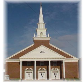
First United Methodist Church 122 N. Center St. Grand Prairie, Texas 75050 972-264-6148